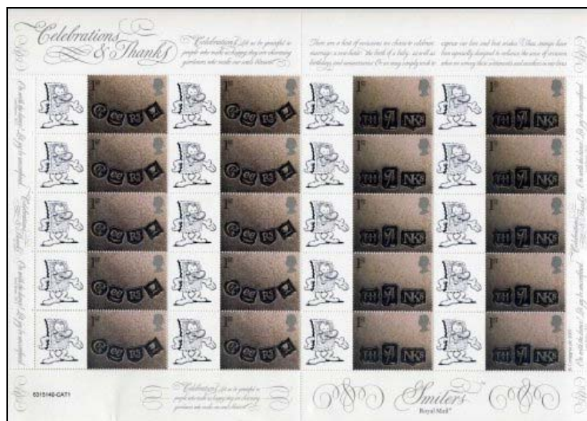
An early example of Phil Stamp's love of Smilers Sheets!