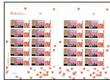
Three sheets were produced and two used for the commemorative covers