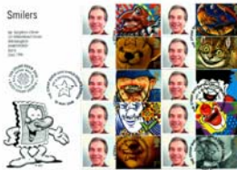
The First Cover