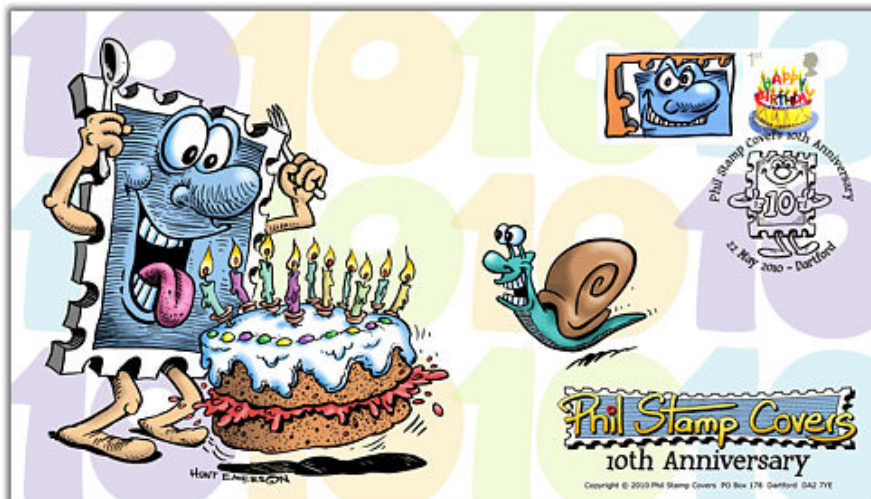
Cover No.166 - Phil Stamp Covers 10th Anniversary