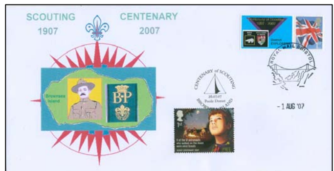
Bristol Smilers (Overprint) - First Day Cover

The sheets occasionally appear on eBay and when they do they are keenly fought over by Smilers enthusiasts. The overprinted variety is going to be the more difficult to come by than the original sheet and will no doubt command high premiums. So keep Smiling and happy hunting!