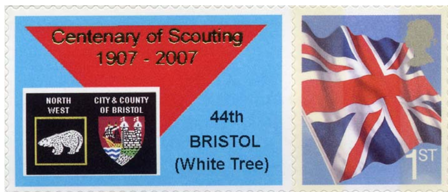
Detail of gold-foil overprint to label on Centenary sheet

The sheets occasionally appear on eBay and when they do they are keenly fought over by Smilers enthusiasts. The overprinted variety is going to be the more difficult to come by than the original sheet and will no doubt command high premiums. So keep Smiling and happy hunting!