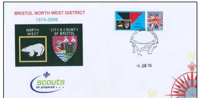
Bristol Scout Smilers - First Day Cover